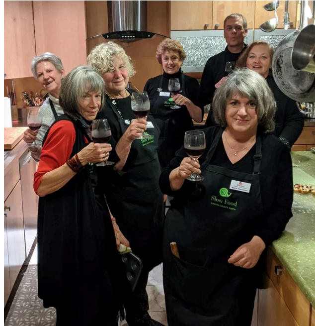
The Sonoma County North Team