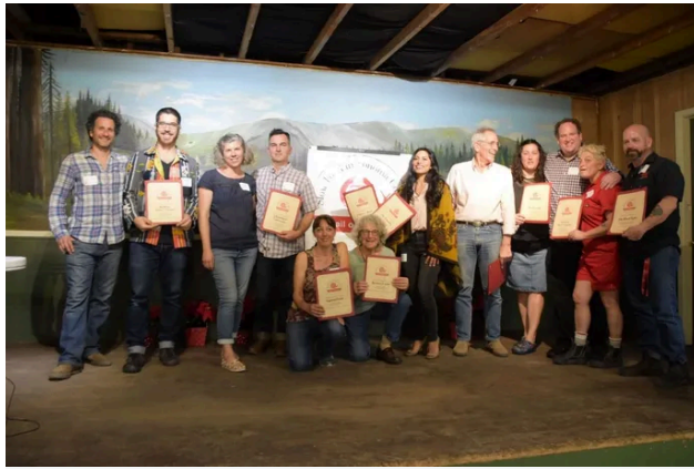
2019 Snail of Approval Awardees