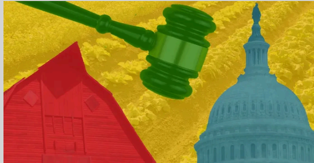
Slow Food USA, "Flustered by the Farm Bill?"

Some of us who are involved with Slow Food and other organizations dedicated to a healthy food system shy away from topics like legislation, policy, and advocacy. But without local, state, and federal policies to ensure that local small farms and ranches are protected, supported and assisted, we would be spinning our wheels in all the other work we do.